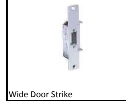
INS Lifeguard - Door Strike