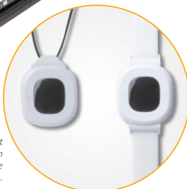
Optional Mia BT4 wrist or pendant transmitter lets you trigger an alarm without touching your phone (within Bluetooth range).