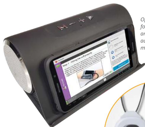
Optional SmartDock allows for wireless charging and features enhanced audio quality via built-in microphone and speakers.

◇ Professional TeleHealth Service in development, coming soon.