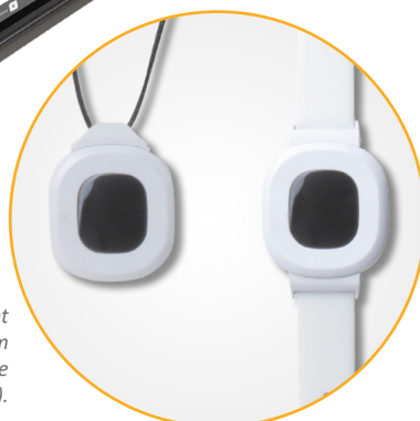
Optional Mia BT4 wrist or pendant transmitter lets you trigger an alarm without touching your phone (within Bluetooth range).