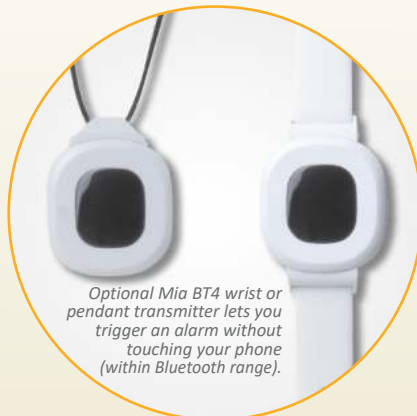
Optional Mia BT4 wrist or pendant transmitter lets you trigger an alarm without touching your phone (within Bluetooth range).