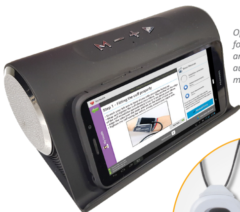
Optional SmartDock allows for wireless charging and features enhanced audio quality via built-in microphone and speakers.

◇ Professional TeleHealth Service in development.